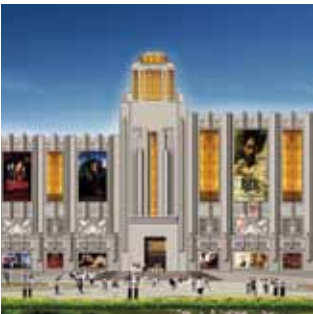
CORAL MALL, JALANDHAR