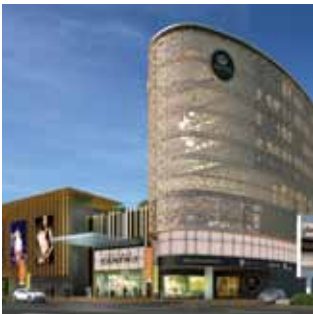
SHALIMAR MALL, LUCKNOW