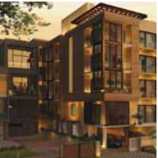
SHALIMAR RETREAT, DELHI