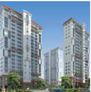
IBIZA TOWN, NCR