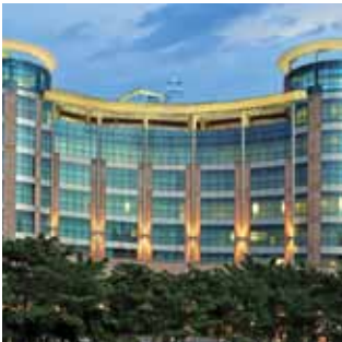
SHALIMAR TCS BUILDING