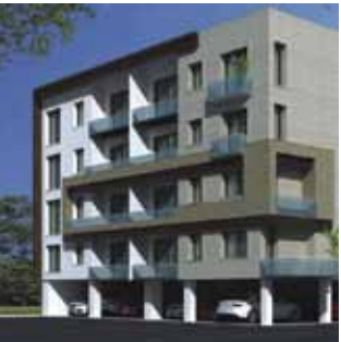
SHALIMAR NEST, DELHI