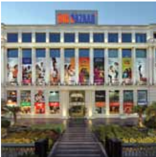
SHALIMAR ELLDEE PLAZA